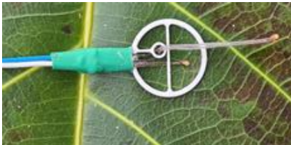
Leaf temperature sensor type LAT-B3, magnet-mounted on leaf surface.

The LAT-B3 ( L eaf-&- A ir-Temperature B roadleaf type) is a precise dual-probe sensor for continuous measurements of leaf surface and ambient air temperatures. Absolute air temperature ( T_{air} ) and leaf temperature ( T_{leaf} ) are measured via two precise micro thermistor probes. Sensor-individual matching of the two probes, ensures high measurement precision of leaf-to-air temperature difference ( \Delta T_{leaf-air} ). The leaf-to-air temperature difference ( \Delta T_{leaf-air} ) can be calculated from concurrent values of the two probes. Designed for broad leaves, the sensor is mounted on the leaf by means of a ultra-light-weight magnetic clamp mechanism.